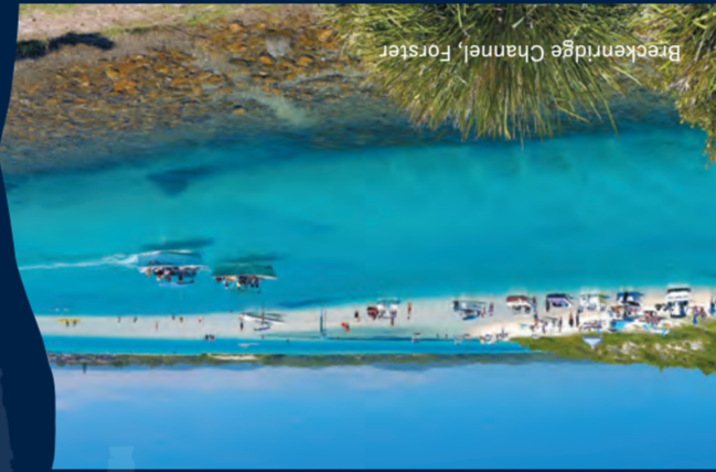
Breckenridge Channel, Forster