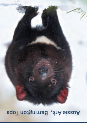
Aussie Ark, Barrington Tops