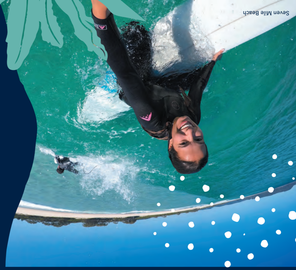
Seven Mile Beach

Barrington Coast is the destination brand of MIDCOAST Council